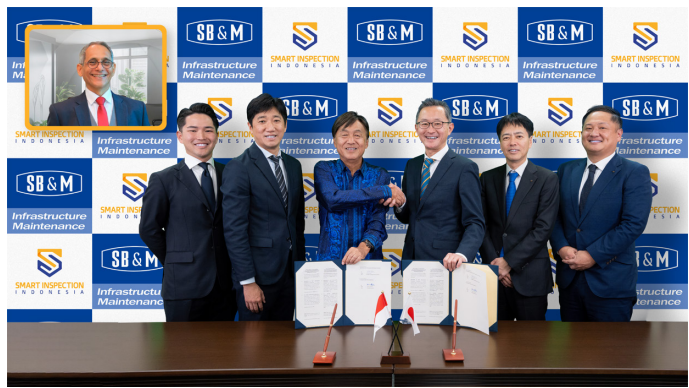
▲ Signing ceremony

SII was established in September 2025 as a subsidiary of PT Nusantara Infrastructure (“NI”), an infrastructure company group under the Metro Pacific Investments Corporation of the Philippines, in which Mitsui holds some equities. In Indonesia, SII is engaged in the applying advanced inspection technologies, enhancing durability of road infrastructure and minimizing lifecycle costs. Its primary focus includes approximately 700 km of toll roads owned by PT Margautama Nusantara, another NI subsidiary, as well as infrastructure facilities in port-related areas. With a long-term vision of becoming a one-stop service provider covering from inspections to repair works, SII has identified strong synergy with SB&M, whose mission is to expand SHO-BOND infrastructure repair technologies developed in Japan through Mitsui’s global network.