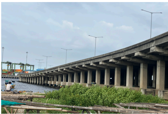
▲ Infrastructure in Indonesia

SHO-BOND & MIT Infrastructure Maintenance Corporation (the “SB&M”), a joint venture 51% owned by SHO-BOND Holdings Co., Ltd. (“SHO-BOND”) and 49% owned by Mitsui & Co., Ltd. (“Mitsui”), has entered into a Memorandum of Understanding (“MOU”) with PT SMART INSPECTION INDONESIA (“SII”) to establish a framework for business collaboration in the Republic of Indonesia.